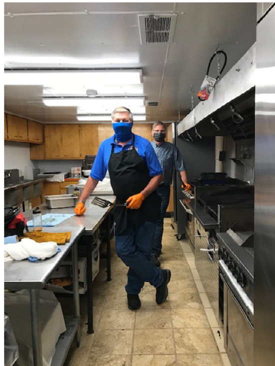
Carlton Lions Hold VFW Burger Night 9/25/2020