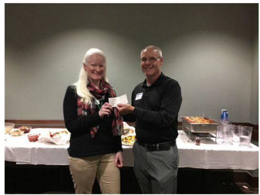
The Duluth Lions Club presented a sponsorship check to the Duluth Centennial LEO Club.