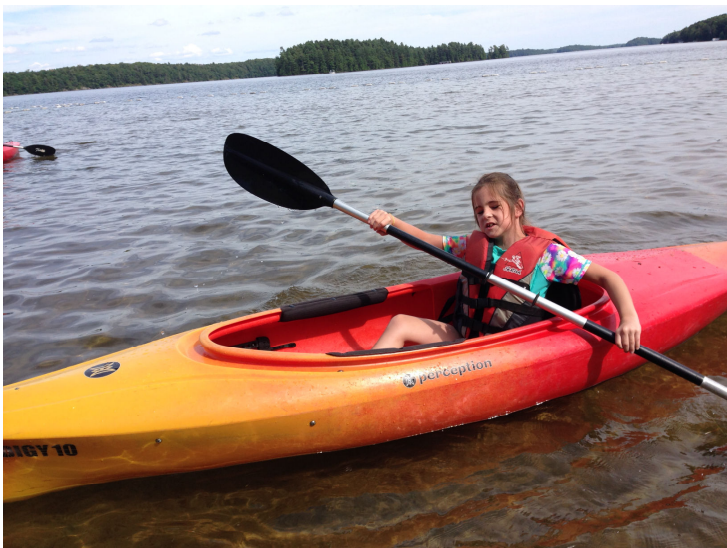
"A young Lake Joe camper enjoying water sports during Family Week at Lake Joseph Centre 2016."