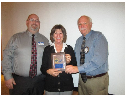
Waddell & Reed