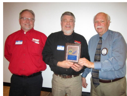
Como Oil and Propane,