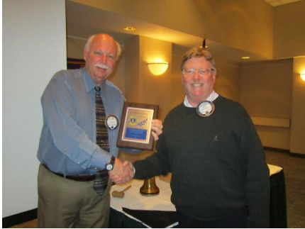
City of Duluth Public Works & Utilities/ Comfort Systems