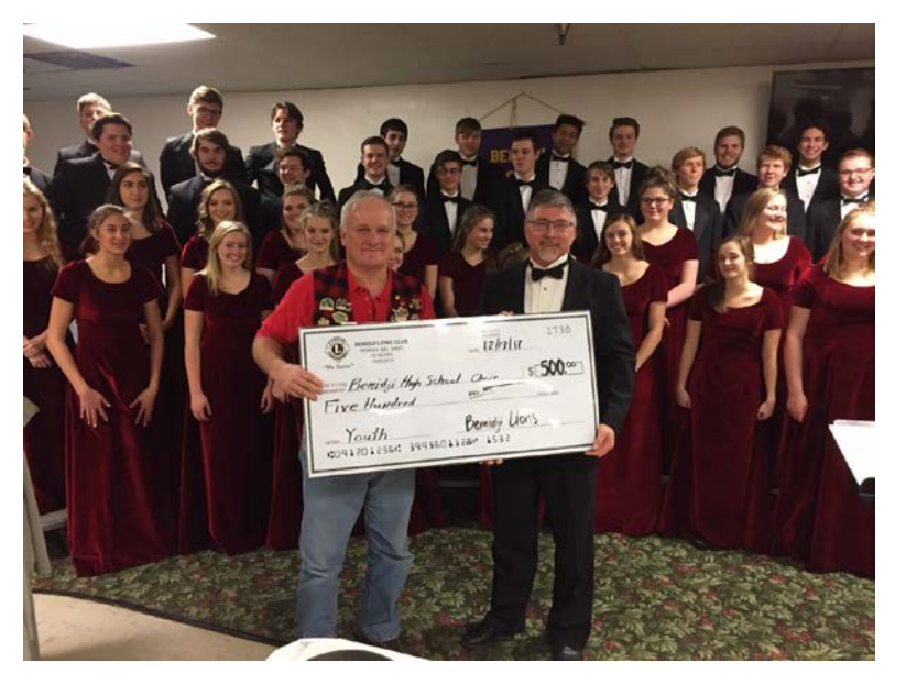
Bemidji Lions presenting the check to the High School Choir.