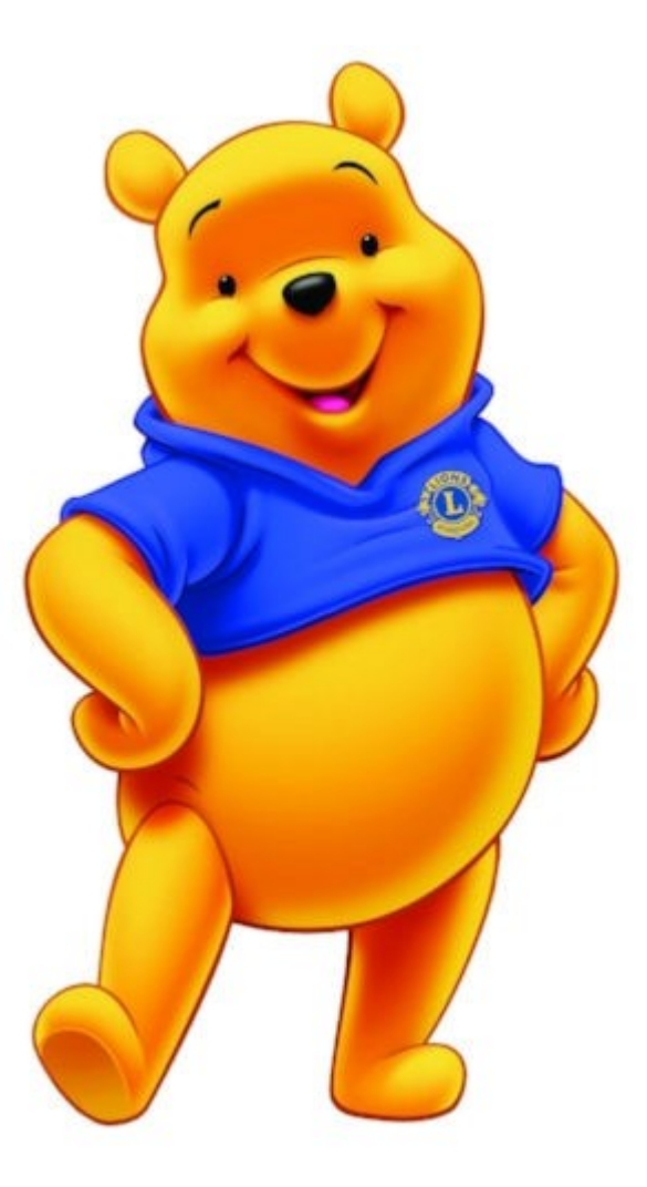
Lion Winnie invites you to Winnie-peg for a Sweet Convention