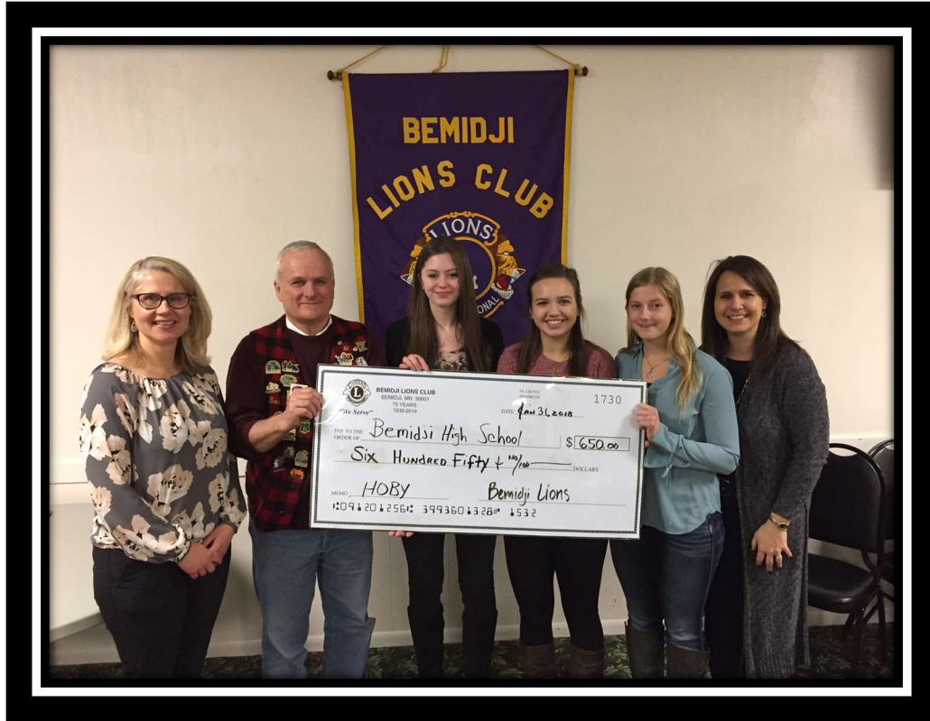
A picture of HOBY recipients receiving a check for $650 so they can attend a Leadership Conference.