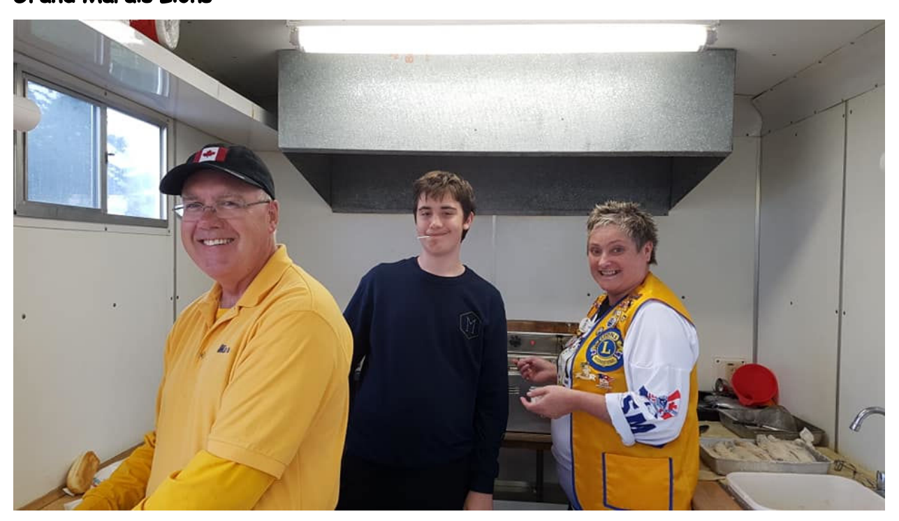
Grand Marais Lions rock the fisherman's picnic...what an amazing group of Lions!