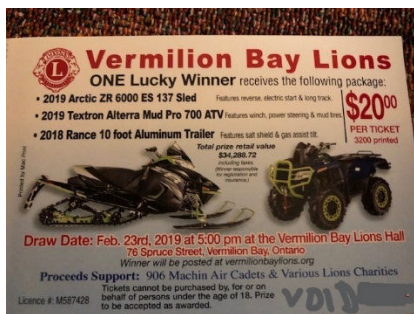
Winter Draw tickets on sale

We wish you all a very Merry Christmas and Happy New Year!