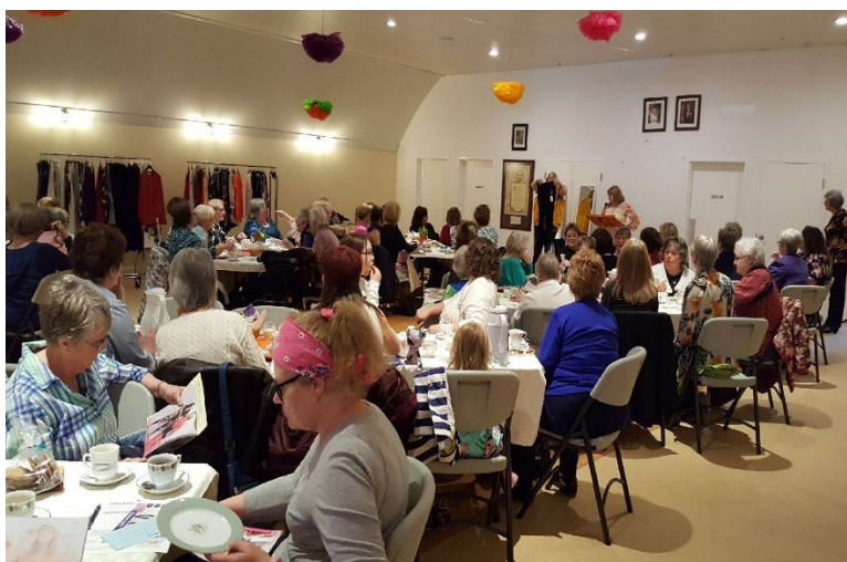
Spring Tea, Bake Sale, Fashion Show-Vermilion Bay Lions Hall

2019 New Members Induction- Vermilion Bay Lions Roar