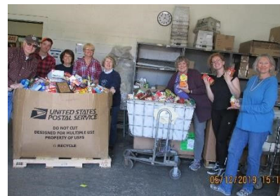
Having fun sorting food items!