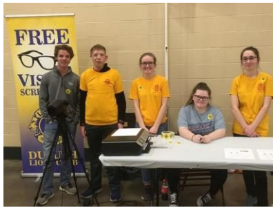
Duluth Centennial Leos help out