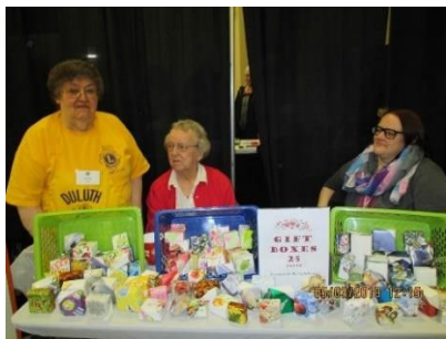
Duluth Lionesses were ready to help the Lighthouse with sales.