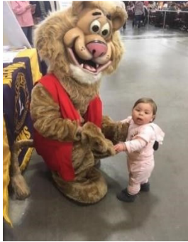
Our Mascot, Roary, greets a young Pancake Day diner.