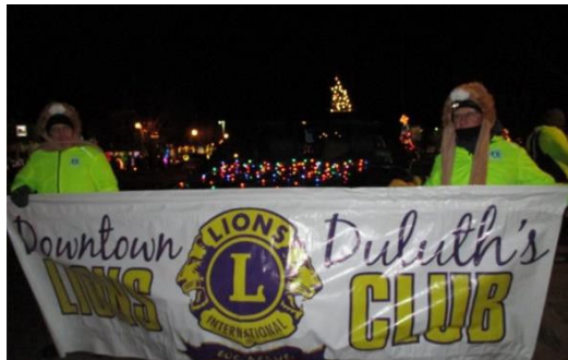
Duluth Lions Club banner