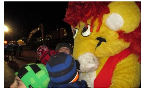
The children loved Roary