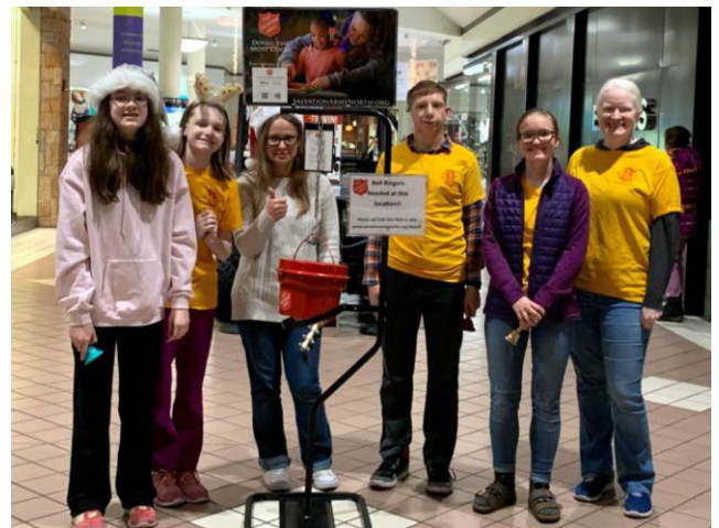
Duluth Centennial Leos ring bells for the Salvation Army at Miller Hill Mall