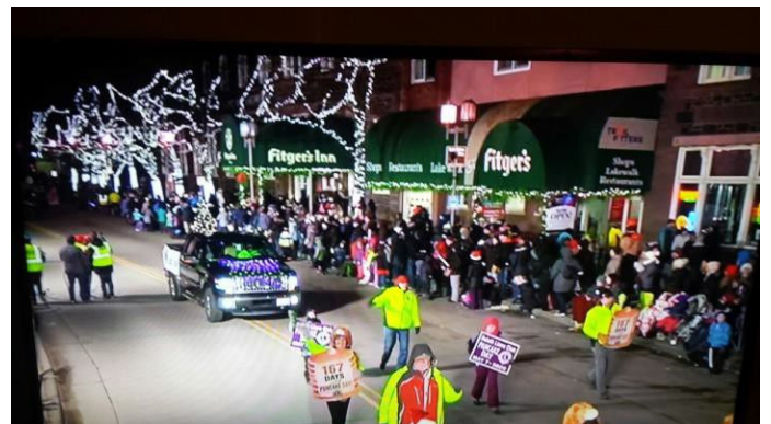
Duluth Lions marching in the parade